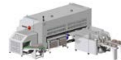
Compact stacker + Two-lane serviette collector + Smarty