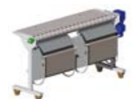
Two-lane serviette collector