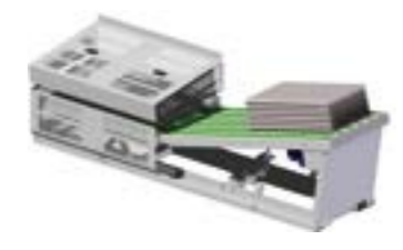
Compact ROLL-OFF stacker 5 tablecloths 10 sheets