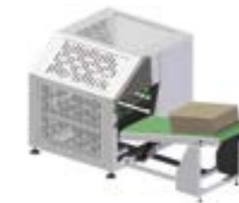
Compact stacker 10/15 tablecloths 10 sheets