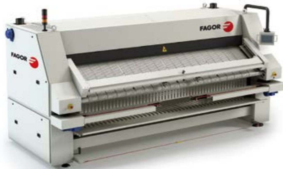
POSEIDON with optional automatic feeder

The POLARIS models on the other hand are dryer-ironers only, with the option of working as pass-through machines, without any type of folding.